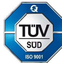
Michael Fernald Head of Central Certification Body Page 1 of 3

The certificate is valid from August 28, 2024 until August 27, 2027 With a re-issue date on N/A